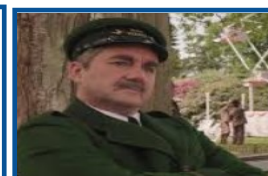
Park keeper—a person who keeps the park clean and safe for the public.