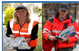
Postal worker—a person who delivers letters and parcels to